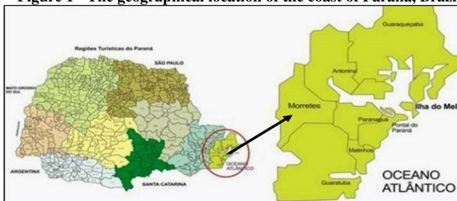
Figure 1 - The geographical location of the coast of Paraná, Brazil

This fact created serious social problems since the remaining populations' agricultural areas were reduced, consequently lowering their incomes and forcing them to move to other regions in a short time. As a result, the quality of life declined, the survival of the remaining population became difficult, and often the only healthcare accessibility was through the benzedeiros . Thus, this study selected a region where benzedeiros have been aiding the population since colonial times, according to records, particularly those who are socially vulnerable.